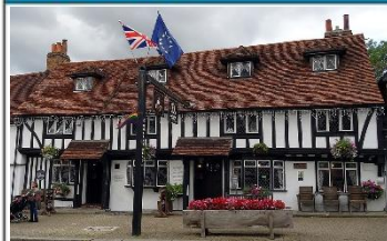
The Queen's Head