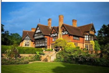
Grim's Dyke Hotel