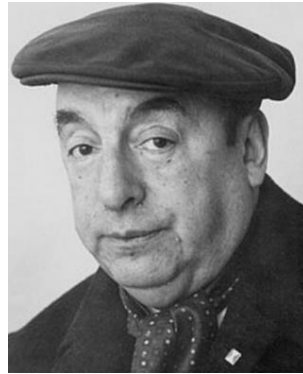
Poet: Pablo Neruda (1904-1973)