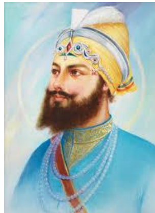
Guru Gobind Singh