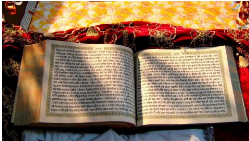
Guru Granth Sahib