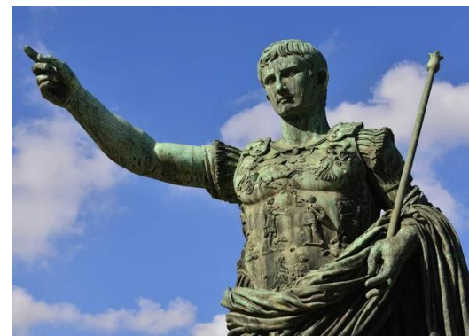
Emperor Julius Caesar