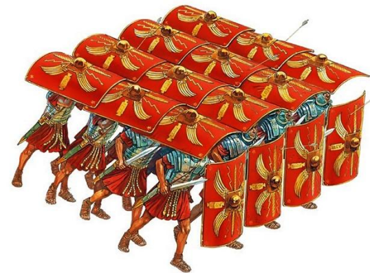
Tortoise format of a Roman army