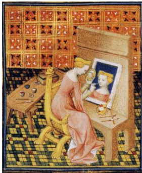
Iaia of Cyzicus