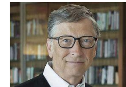
Bill Gates created an operating system called Windows.