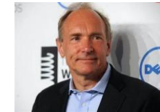
Sir Tim Berners-Lee created the World Wide Web.