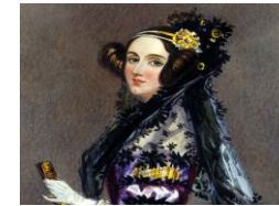
Ada Lovelace was the first computer programmer.