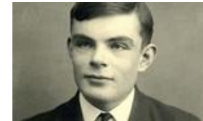
Alan Turing designed the first modern computer.