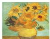
Vincent Van Gogh