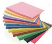
Variety of card and paper