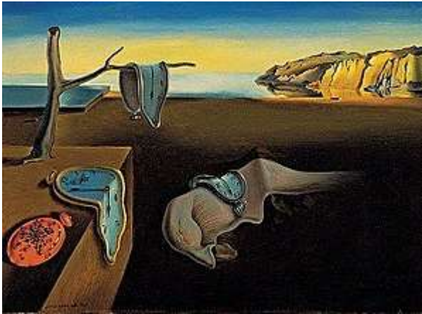
Salvatore Dali 'The Persistence of Memory' 1931