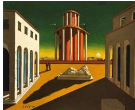
Giorgio De Chirico 'Piazza d'Italia' 1913