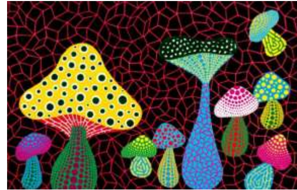
Yayoi Kasuma 'Mushrooms' 2005