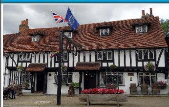
The Queen's Head