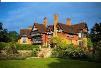
Grim's Dyke Hotel