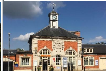
Hatch End Station