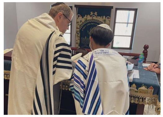
Wearing the tallit and kippah during prayer