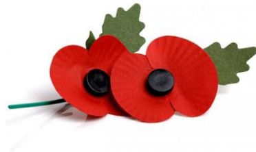
Poppies for Remembrance Day