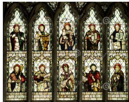
Stained Glass Window: Saints in a Church