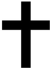
Christian Cross Logo