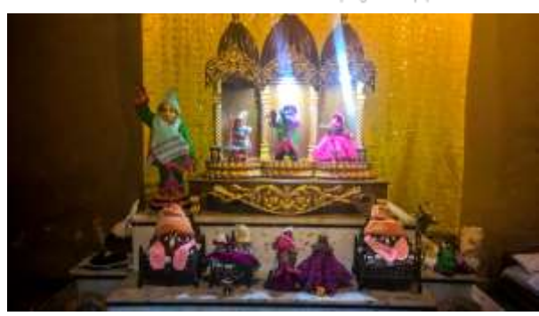
Jain shrine inside a temple or derasar

Hindu home shrine where the puja happens