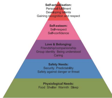
Maslow's triangle - PowerPoint Slide - Year 6 - Piece 2