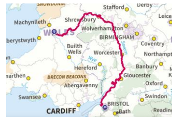
River Severn (longest in the UK)