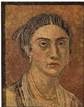
Pompeii (VI, 15, 14)