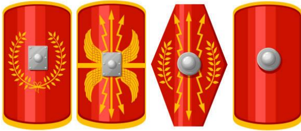
Roman shield design