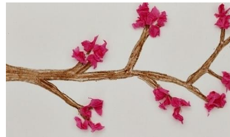
Tissue paper, crayons, paint, card, pencils