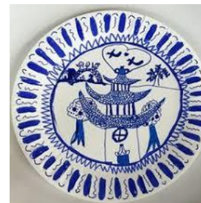
Paper plate, felt tip pen