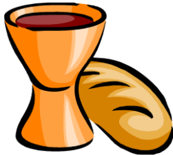
Bread and Wine