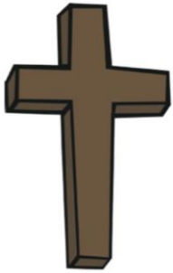
The Holy Cross