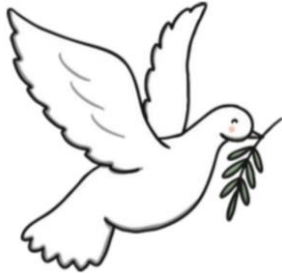
The White Dove