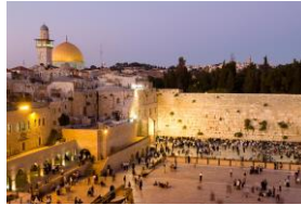
Jerusalem (where Jesus died)