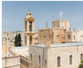
Bethlehem (where Jesus was born)