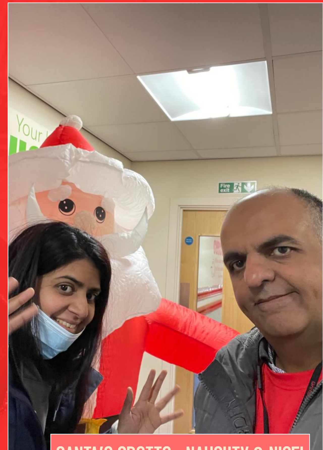
SANTA'S GROTTTO - NAUGHTY & NICE!