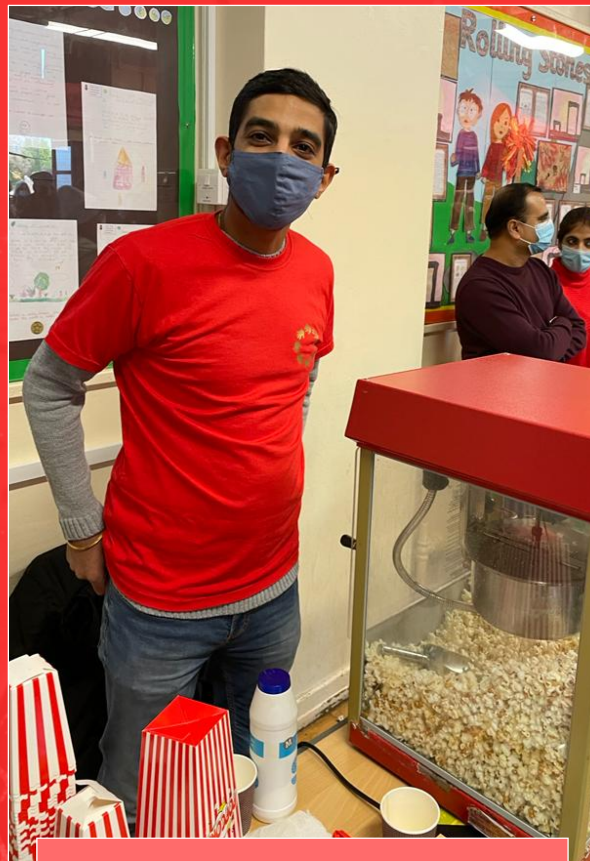
NEW COMMITTEE MEMBERS POPPING!