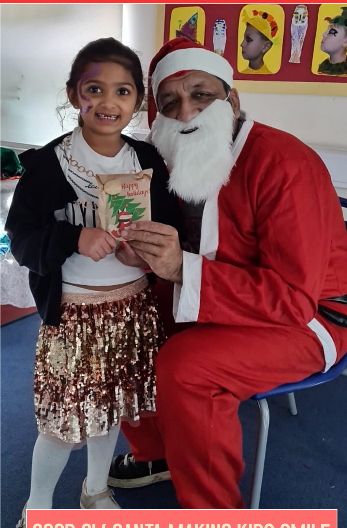
GOOD OL' SANTA MAKING KIDS SMILE