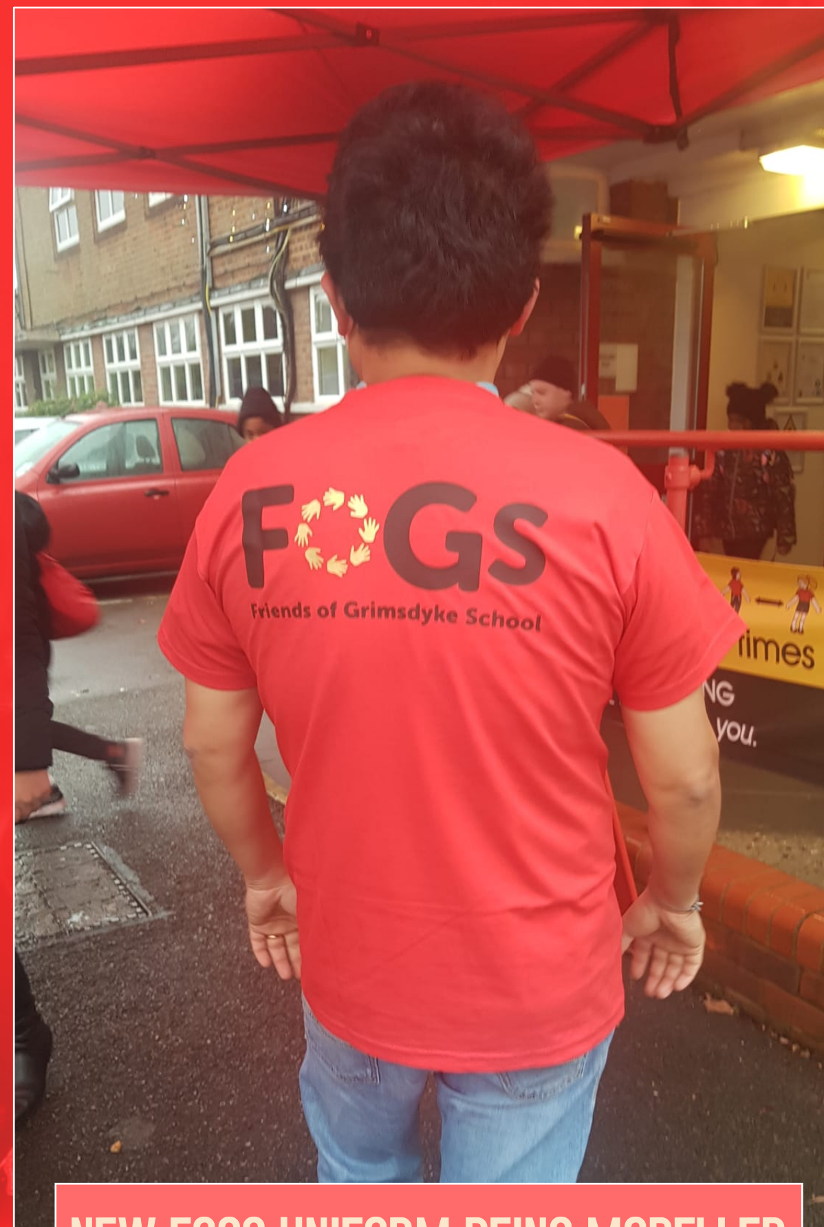
NEW FOGS UNIFORM BEING MODELLED