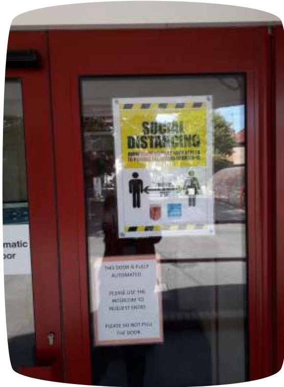
The front door