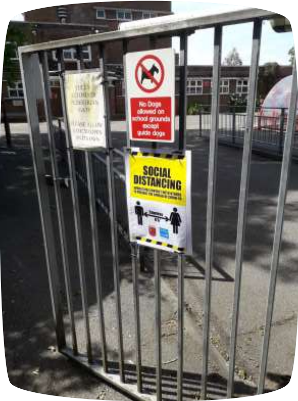
The pedestrian gate